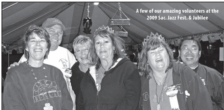
A few of our amazing volunteers at the 2009 Sac. Jazz Fest. & Jubilee