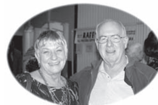
Photos from Dec. 13 are on pg. 8-9 Rent Party photos from Jan. 10 are on pg. 10-11

JUBILEE DISCOUNT FOR STJS MEMBERS THROUGH APRIL 11TH